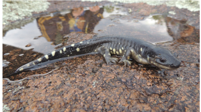
Figure 7. Ambystoma rosaceum (Tarahumara Salamander) is endemic to México, its EVS is 14, placing it in the high vulnerability category. Its conservation status has been evaluated as Least Concern (LC) by IUCN, and assessed as Special protection (Pr) species by SEMARNAT.

Calvillo Valley (Region 4), with 21 shared species and CBR value of 0.46 (Table 5).