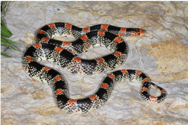
Figure 6. Rhinocheilus lecontei (Long-Nosed Snake) is not endemic to México, its EVS is 8, placing it in the low vulnerability category. Its conservation status has been evaluated as Least Concern (LC) by IUCN, and not assessed (NS) species by SEMARNAT.

The greatest degree of resemblance occurs between the adjacent Sierra El Laurel (Region 3) and Calvillo Valley (Region 4), with 38 species shared and a CBR value of 0.76 (Table 5). While there is a distinct elevation difference between the two regions, the contact favors an altitudinal gradient distribution of species (Fig 1). Similarly, the adjacent Sierra Fría (Region 5) and Calvillo Valley (Region 4) share 36 species and a CBR value of 0.75. The two mountainous regions (Regions 3 and 5) share 40 species with a CBR value of 0.74. As expected, there is a large degree of resemblance between the Semiarid Zone (Region 1) and Southern Grasslands (Region 2) (31 species; CBR value of 0.67), due to their wide contact area, which forms a gradient from a semiarid to more humid area. Similarly, there is a large degree of resemblance between the Southern Grasslands (Region 2) and Calvillo Valley (Region 4), which share 30 species and a CBR value of 0.66. The lowest degree of resemblance occurs between Semiarid Zone (Region 1) and