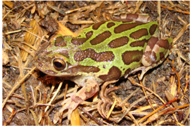
Figure 3. Smilisca dentata (Upland Burrowing Tree-Frog) is a near endemic to the state and endemic to México, its EVS is 14, placing it in the high vulnerability category. Its conservation status has been assessed as Endangered (EN) by IUCN, and threatened (A) species by SEMARNAT.

Reptiles are best represented in the Sierra El Laurel (Region 3; 41 species) and the Sierra Fría (Region 5; 39 species). This same pattern follows for lizards, which are also best represented in both the Sierra El Laurel (Region 3; 15 species) and the Sierra Fría (Region 5; 14 species). The Sierra El Laurel is home to Sceloporus aurantius , a species endemic to a small area, with only three known localities: one located at the Aguascalientes and Jalisco border and two in Zacatecas (Grummer and Bryson 2014; Carbajal-Márquez and Quintero-Díaz 2015; Fig. 4). The representation of