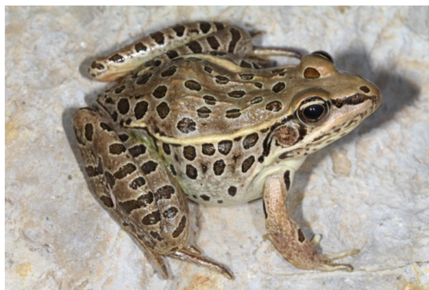
Figure 5. Lithobates magnaocularis (Northwest Mexico Leopard Frog) is endemic to México, its EVS is 12, placing it in the medium vulnerability category. Its conservation status has been evaluated as Least Concern (LC) by IUCN, and not assessed (NS) species by SEMARNAT.

ciliaris , Sceloporus brownorum , Sceloporus scalaris , Crotalus lepidus and Crotalus pricei . Finally, there are no species limited to the Southern Grasslands (Region 2) and Northern Grasslands (Region 6).