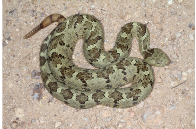
Figure 9. Crotalus aquilus (Querretaran Dusky Rattlesnake) is endemic to México, its EVS is 16, placing it in the high vulnerability category. Its conservation status has been evaluated as Least Concern (LC) by IUCN, and assessed as Special protection (Pr) species by SEMARNAT.

The absolute and relative numbers for each of the three EVS categories (low, medium, high), arranged by major herpetofaunal group, are as follows: anurans 6 (37.5%), 7 (43.7%), and 3 (18.7%); salamanders 0 (0.0%), 2 (66.7%), and 1 (33.3%); turtles 0 (0.0%), 2 (100%), and 0 (0.0%); lizards 3 (13%), 14 (60.9%), and 6 (26.1%); and snakes 15 (37.5%), 13 (32.5%), and 12 (30%). The