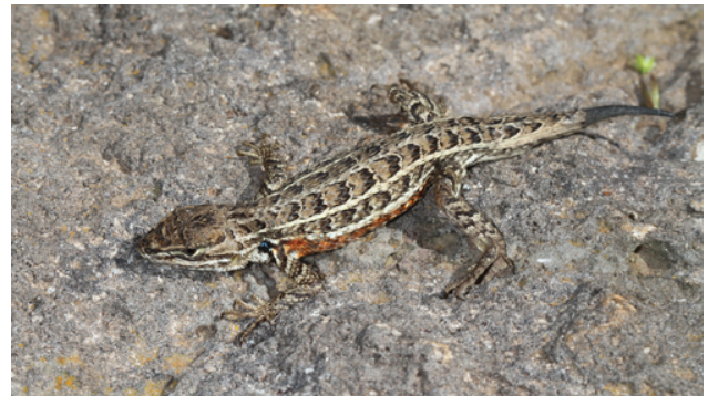
Figure 4. Sceloporus aurantius (Southern Occidental Bunchgrass Lizard) is endemic to the region and endemic to México, its EVS is 14, placing it in the high vulnerability category. Its conservation status has not been evaluated (NE) by IUCN, and not assessed (NS) by SEMARNAT.

snakes is more homogeneous, with four regions with high numbers of species: the Semiarid Zone (Region 1; 24 species), the Sierra El Laurel (Region 3; 24 species), the Calvillo Valley (Region 4; 24 species) and the Sierra Fría (Region 5; 24 species). Finally, turtles are best represented in the Southern Grasslands (Region 2; 3 species),