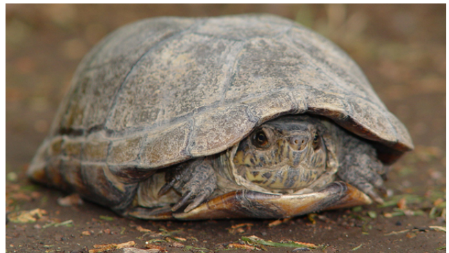
Figure 2. Kinosternon integrum (Mexican Mud Turtle) is endemic to México, its EVS is 11 (medium vulnerability category). Its conservation status has been assessed as Least Concern (LC) by IUCN, and Special Protection (Pr) species by SEMARNAT.

regions are occupied, with the exception of their presence in all six regions. The species found across all the physiographic regions tend to be widely distributed across Mexico ( Anaxyrus punctatus , Hyla arenicolor , H. eximia , Lithobates montezumae , Spea multiplicata , Sceloporus grammicus , S. torquatus , Aspidozelis gularis , Conopsis nasus , Pituophis deppei , Trimorphodon tau , Diadophis punctatus , Thamnophis eques , Thamnophis melanogaster , Crotalus